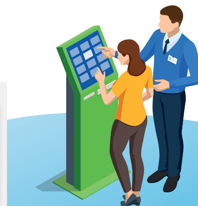
JavelinKIOSKmultihopper A4 V1