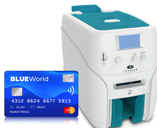
JavelinMBOSS A4 V1